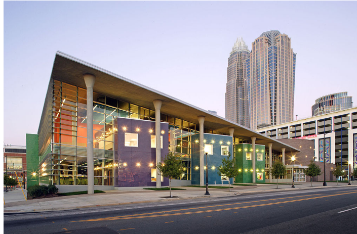
Imaginon outside. (2019).

Founded in 2019, Exploratorium is an urban “hands-on” public library specifically for patrons ages 0-18. The facility is 100,000 square feet located in Mecklenburg County, North Carolina, serving the city of Charlotte and other bedroom communities within Mecklenburg County. Exploratorium is a unique branch in this system but shares the common vision and goals of the greater Charlotte-Mecklenburg Library System.