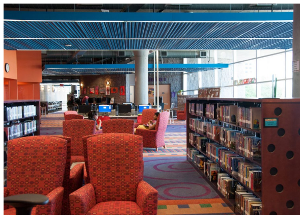
Teen Loft. (n.d.).

The Teen Loft is approximately 4,000 square feet located on the third floor and is a space dedicated to tweens and teens (grades six through twelve) (Wikipedia, 2019). The collection housed here includes graphic novels for juveniles and young adults, as well as two Makerspace areas, and small break-out rooms for group project planning. A computer lab with twenty-five computers dedicated to this age group is housed here in the Teen Tech Center. Children under the age of 12 must be accompanied by an adult when in the Teen Loft.