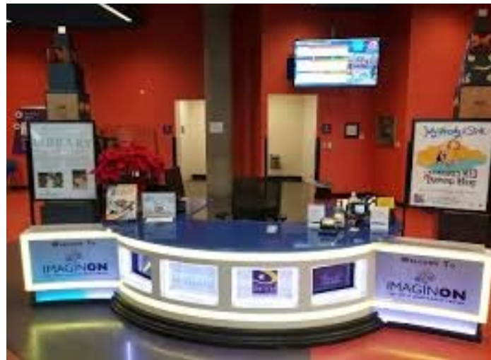
Imaginon information desk. (2019). RetrieveCopyright © 1992 by Rose Tremaind from https://www.cmlibrary.org/blog/whats-your-favorite-place-charlotte-mecklenburg-library

With vibrant décor in bold colors and neon lights outlining the welcome desk, patrons ages 0-18 not only feel welcomed, but that this is “the place” to be.